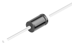
DO-41 Glass case COLOR BAND DENOTES CATHODE